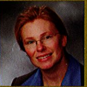
Tari Rayala Architectural Resources